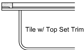
Tile w/ Top Set Trim